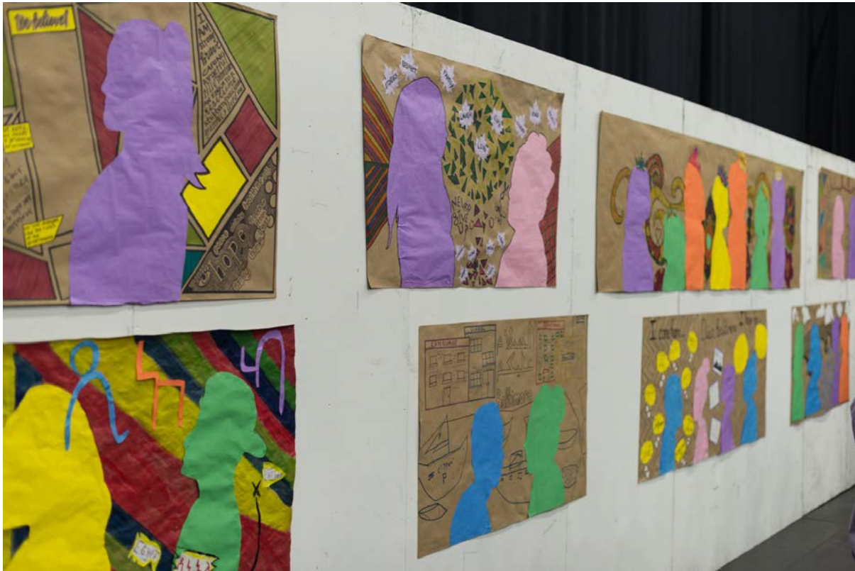
Conversation Pieces created by MAIAI graduate students and Refugee Youth Project partners

We feel deeply fortunate to have had an amazing group of young people join our program. Our refugee student participants were largely from Eritrea, Sudan, and Syria, though their journeys as refugees have often taken them through numerous other countries before landing in the U.S. In the end, the eleven MAIAI graduate students who were involved referred to engaging in this