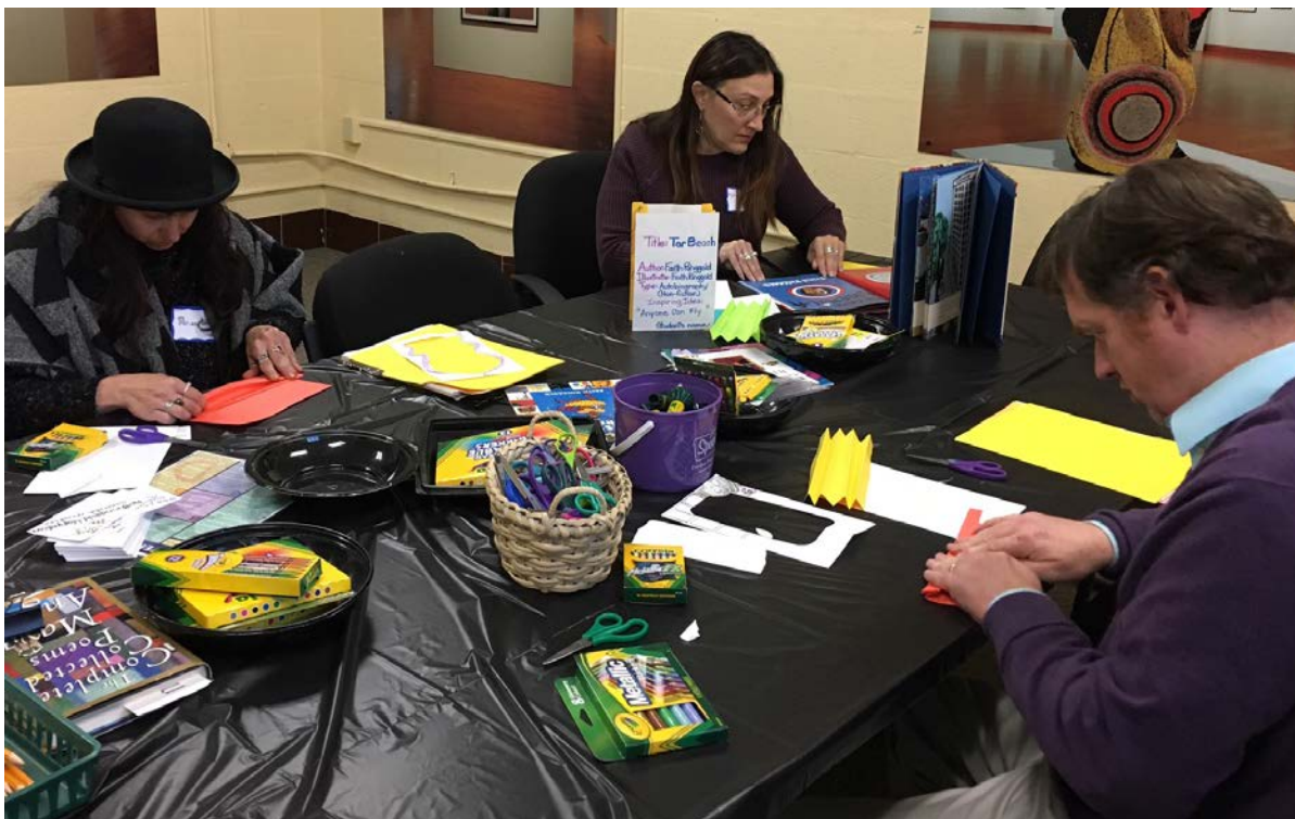
Teachers completed art book making projects (top), and the finished project (below), is shown with the inspiration for the lesson- Tar Beach , by Faith Ringgold.