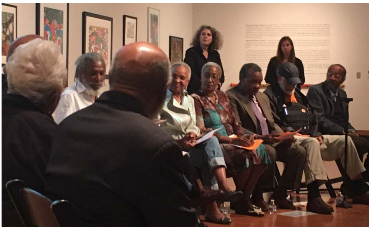
Exhibiting artists shared their career experiences.

The insights gained by listening to this renowned group of African American artists further fueled my excitement and gave me more ideas about using the exhibition works for curriculum development.