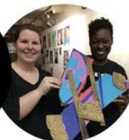
EXHIBIT AND RECEPTION INFORMATION