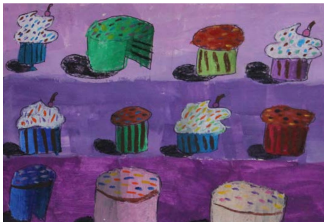
Hailey N., Hilltop Elementary, AACPS