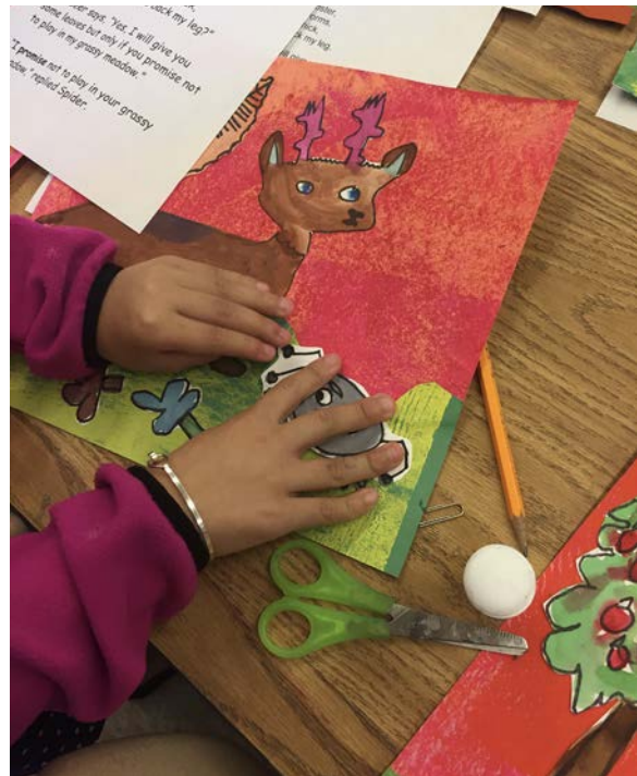
Student working on an illustrated folktale

Following Noa's residency, my art classes worked on creating collage illustrations of their fractured folktale stories. Students collaboratively created painted papers for the background, middle ground