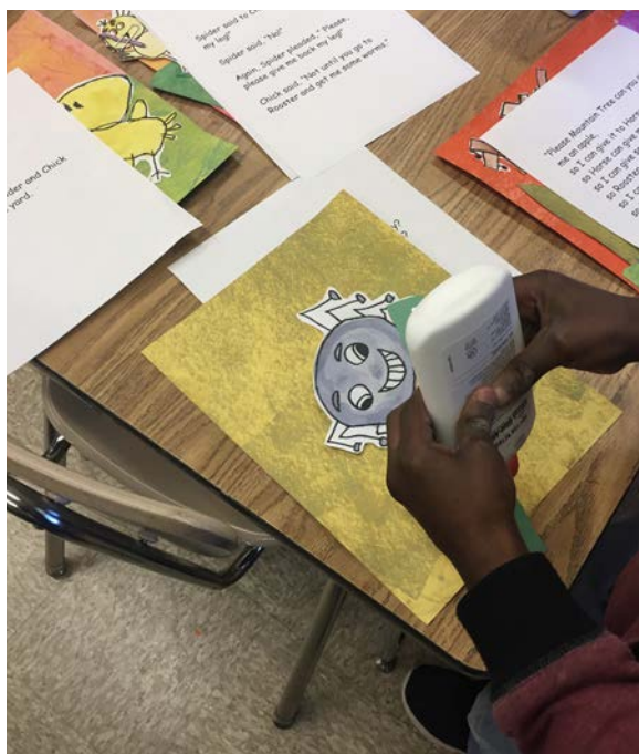
Student working on an illustrated folktale