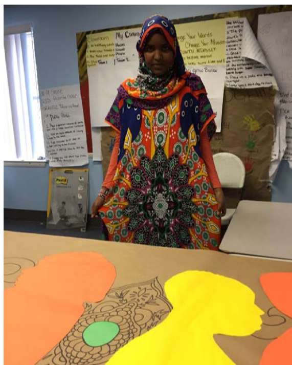
Kowser Dress- source of inspiration for Conversation Piece, Photo by Kate Collins

education (a high priority subject to them), and in shedding light on their experiences and the issues they care about. The course was also invested in giving teachers an intimate window into the experiences of refugee students so that they could become more informed allies and advocates in their own school settings. In addition, they reflected on how collaborative artmaking can foster relationships amongst refugee and American students, between which there can often be fear and miscommunication.