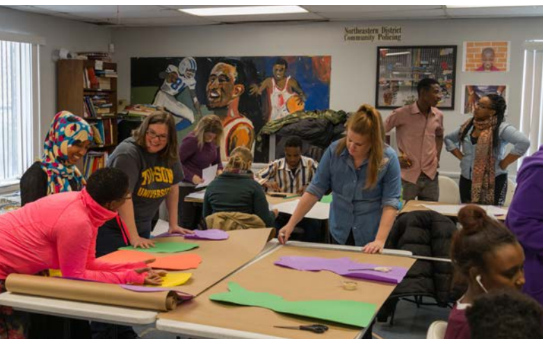
MAIAI grad students and Refugee Youth partners at work

our works as part of a small open house event at Towson University in early December. Now, we look forward to presenting our works again at an Open Hours event at the Baltimore Museum of Art on January 20 th as part of their Imagining Home exhibit. Our aim is to make this an ongoing partnership between the Refugee Youth Project and the MAIAI program at Towson.