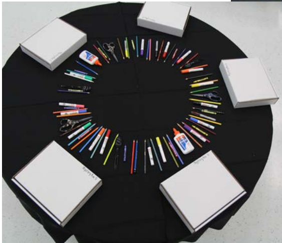
The Phil Hansen Mystery Box Art Teacher Challenge, sponsored by School Specialty (above)