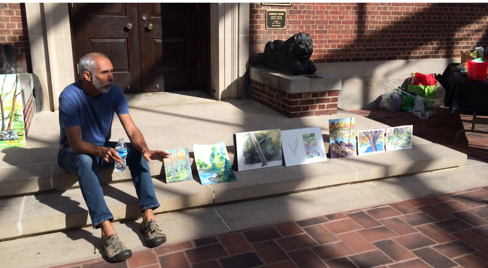
Artist/Instructor leads a group critique of participants' paintings (below)

If you have a workshop idea or a great location idea, we want to hear from you! Contact us at professionaldevelopment@marylandarted.org