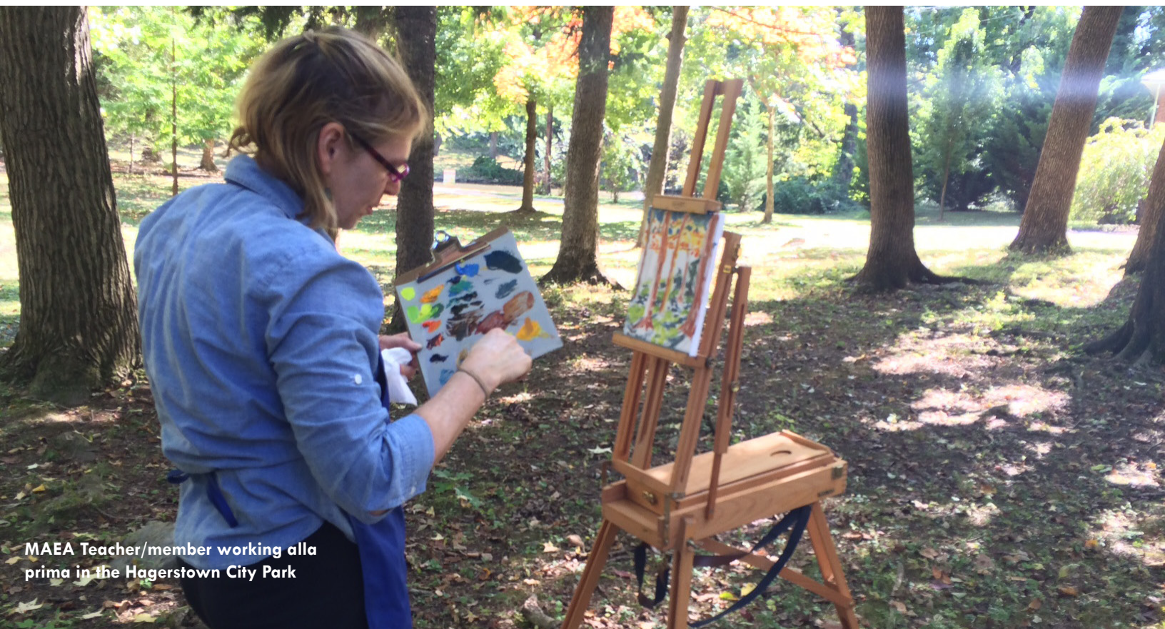
MAEA Teacher/member working alla prima in the Hagerstown City Park