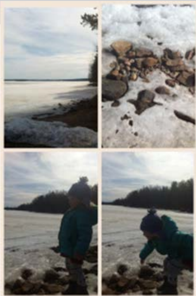
Throwing stones at a frozen lake north of the Arctic Circle

This first in a series of articles taken from my blog, https://kulttuuriculture.wordpress.com/ , reflects specific themes and encounters along my research journey: